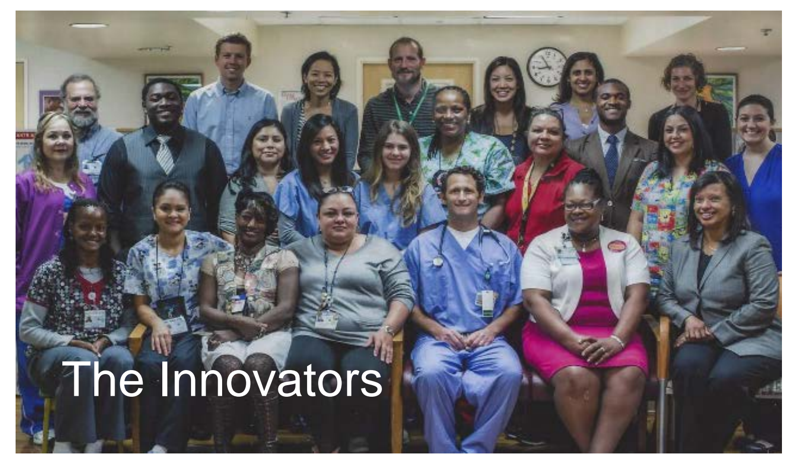
Highland Hospital Pediatric team, Eastmont Wellness Center Dental Team, UCSF Pediatric Dentistry Externs

*Robust data were only available for Eastmont Wellness Center. In FY2014, 25% of the Peds pts 0-2 had a dental home at Eastmont Dental. In FY2015, 28% of the Peds pts 0-2 had a dental home at Eastmont. These statistics compare favorably to the national average of 7%.