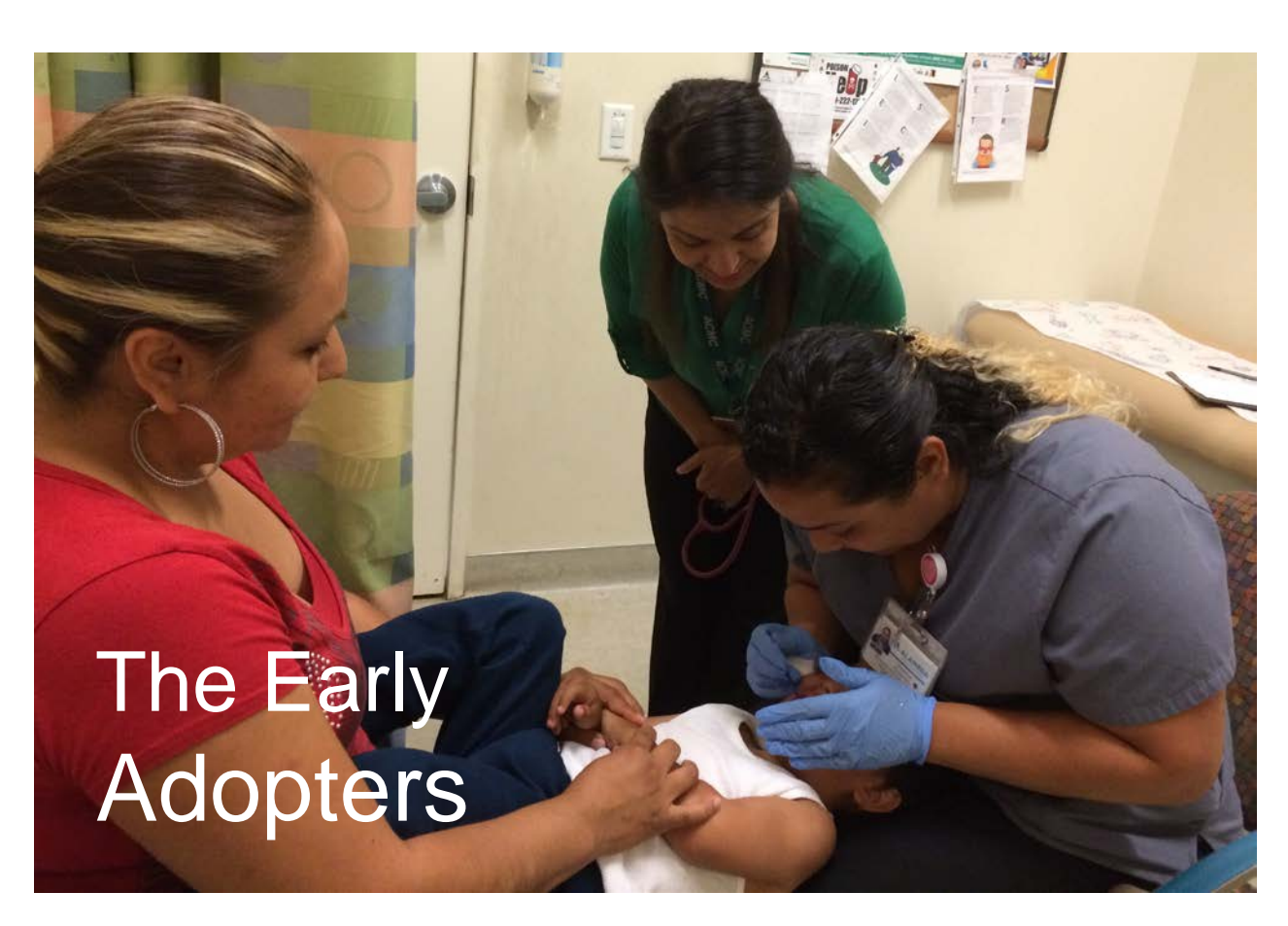
Eastmont Wellness Center Pediatric Team